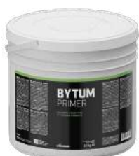
BYTUM PRIMER page 53