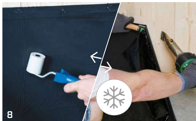
8 ROLLER, HOT GUN