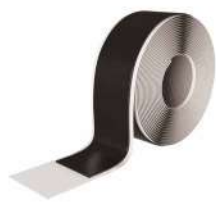
BLACK BAND page 144